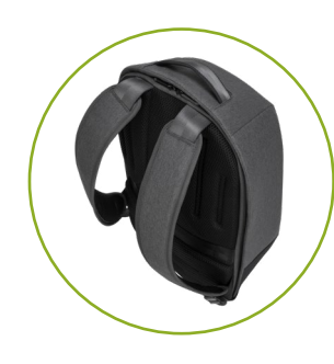
Comfortable ergonomic straps