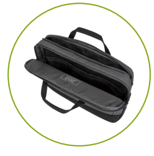
2 main compartment