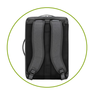
Comfortable ergonomic straps