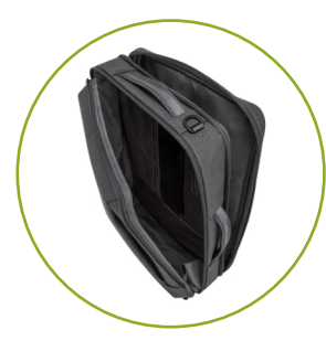
2 main functional compartments