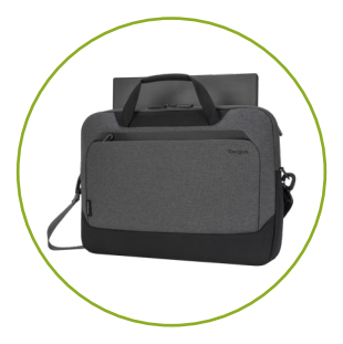
Air mesh shoulder strap