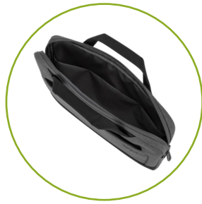
1 main compartment