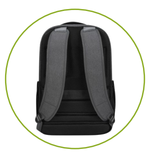
Padded back panel and luggage strap