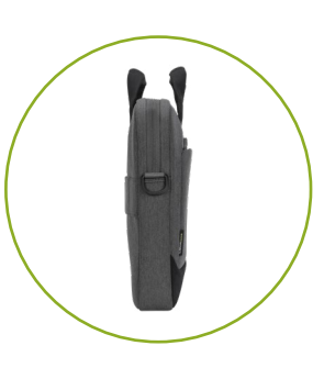
Comfort carry handles