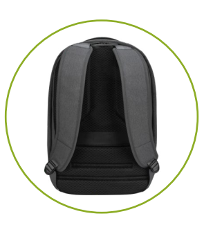
Padded back panel