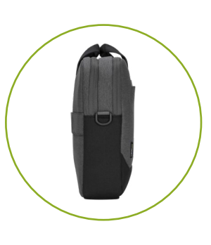
Comfort carry handles