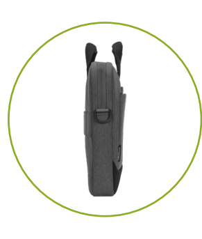
Comfort carry handles