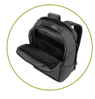
2 main functional compartments