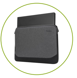
Foam laptop protection