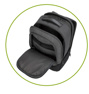
3 main functional compartments