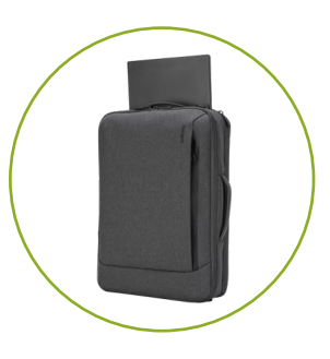
All-in-one backpack and briefcase