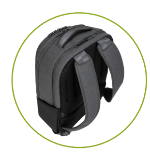
Comfortable ergonomic straps