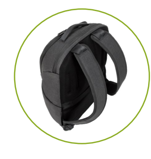
Comfortable ergonomic straps