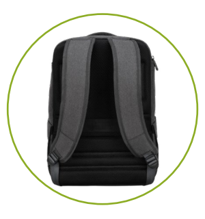
Padded back panel