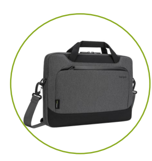
Air mesh shoulder strap