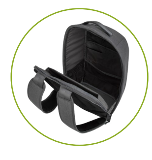
2 main functional compartments