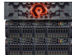
FIGURE 2: FlashArray//C60 capacity scaling